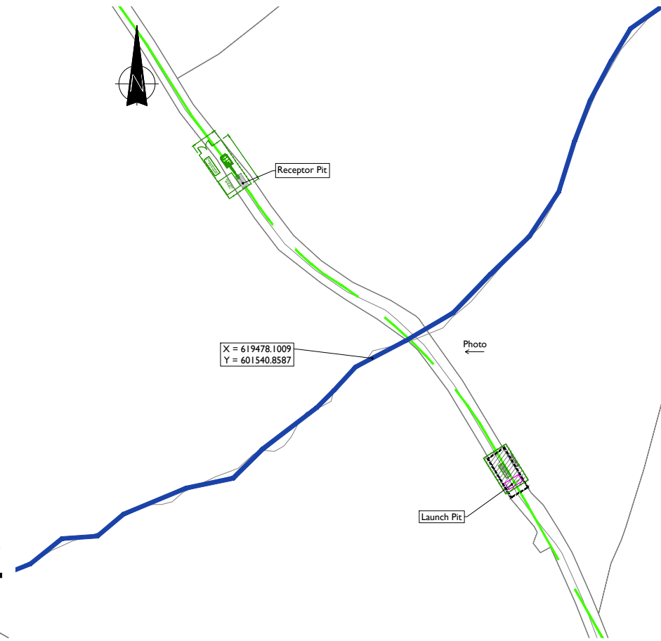
Plan View Scale : 1:2000

Map Series: Prime Data Vector ITM Centre Point Co-ordinate: X, Y = 6622179, 601941 Ordnance Survey Ireland Licence No. CYAL50261649 Copyright: © Suirbhéireacht Ordnáis Éireann, 2022 © Ordnance Survey Ireland, 2022